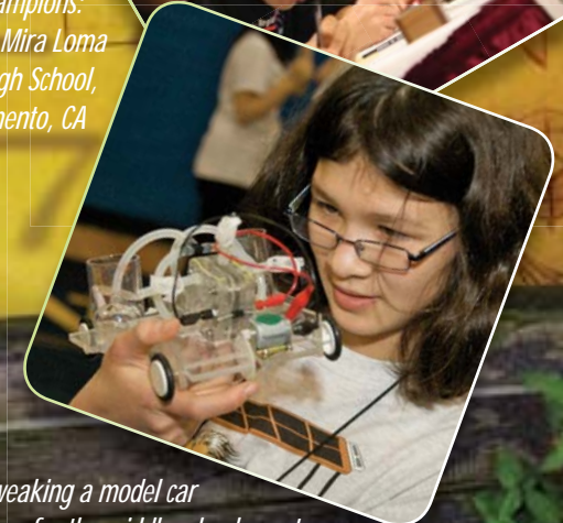
Tweaking a model car for the middle school event