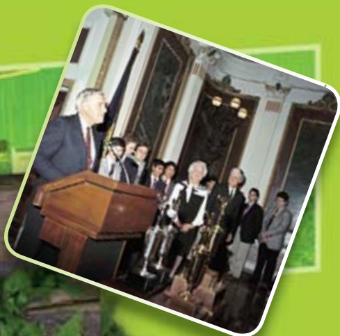
1991 Champions from Lubbock High School, Lubbock, TX receive recognition from Secretary of Energy James Watkins and First Lady Barbara Bush.

Launched in 1991, the National Science Bowl® (NSB) is a highly competitive science education and academic event among teams of high school and middle school students who compete in a fast-paced verbal forum to solve technical problems and answer questions in all branches of science and math. Regional and National events encourage student involvement in math and science activities of importance to the Department of Energy and the Nation.